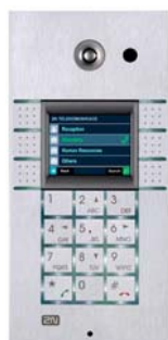
2N® Helios IP Vario