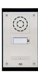
2N® Helios IP Uni

The 2N® Helios IP family is a wide range of door intercoms for every situation - whether in security, business, emergency, or any other special area.