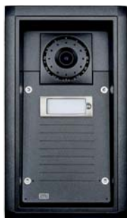
2N® Helios IP Force