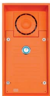
2N® Helios IP Safety